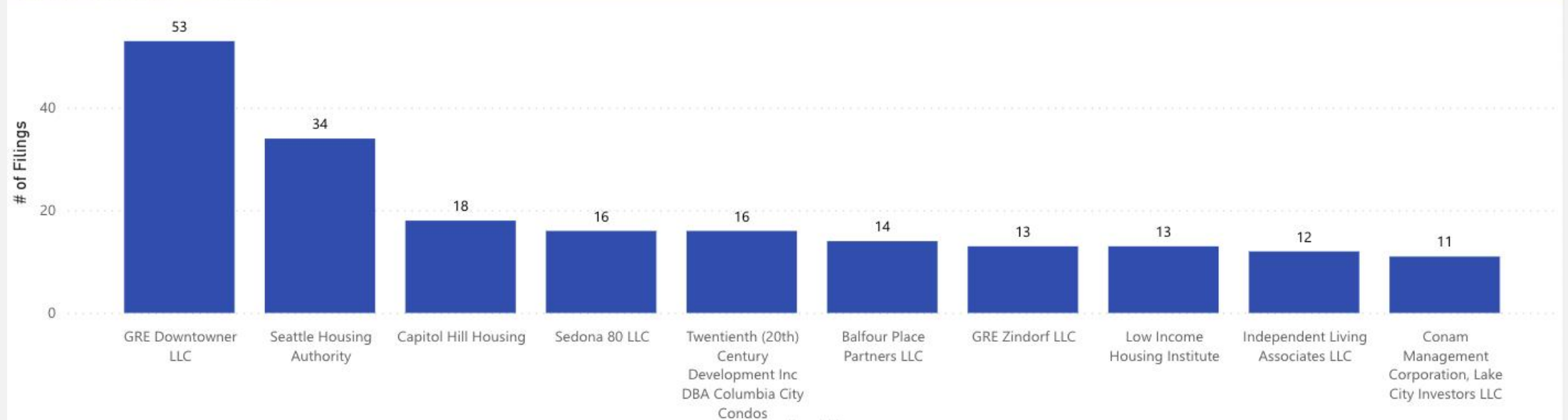
Top 10 Plaintiffs - Seattle